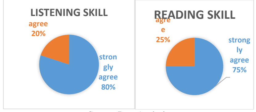
Chart 2. The importance of English in Hospitality industry: Listening and Reading

both in class and out class setting, and teachers need to monitor the students' autonomous learning style to evaluate whether or not they have met the learning objectives.